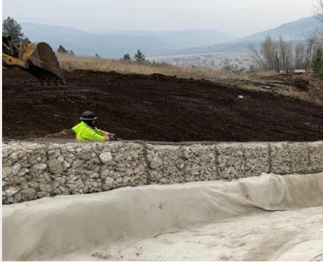
Erosion Control Grand Forks, BC