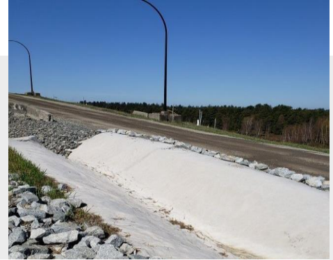
Ditch Lining Vancouver, BC