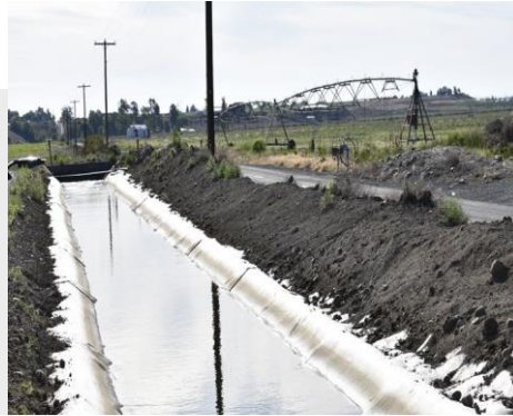
Irrigation Canal Quincy, WA USA